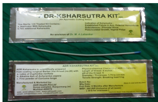
Figure 2: ADR Ksharsutra-Kit